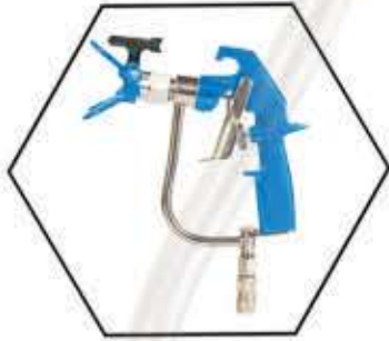
Airless Spray Gun