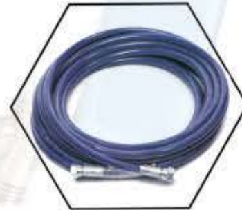
High Pressure Paint Hose