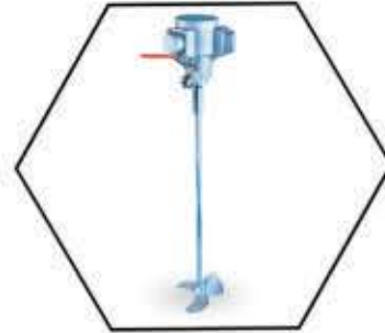
Stirrer / Agitator