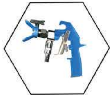
Airless Spray Gun HD