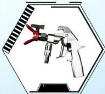
Airless Spray Gun