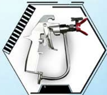
Airless Spray Gun HD