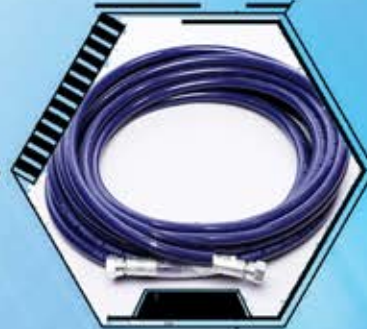
High Pressure Paint Hose