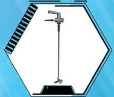
Stirrer / Agitator